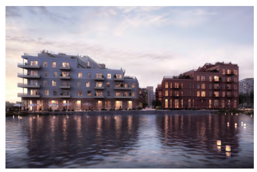
UN17 Village in Denmark Ready Mix Concrete & Concrete Element Application